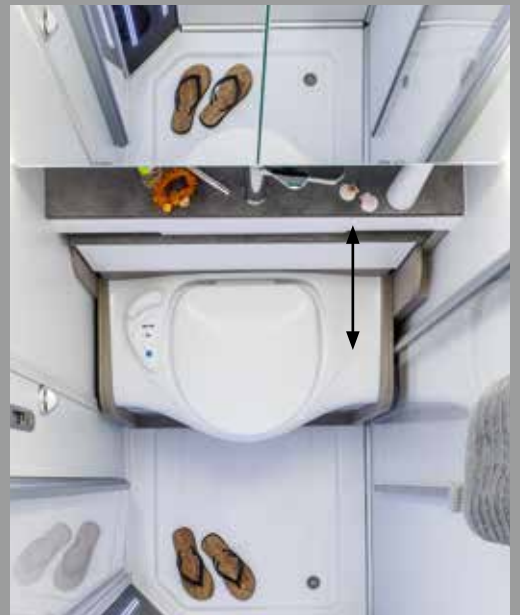
Toilet seat disappears under the vanity thanks to push-to-open/close design