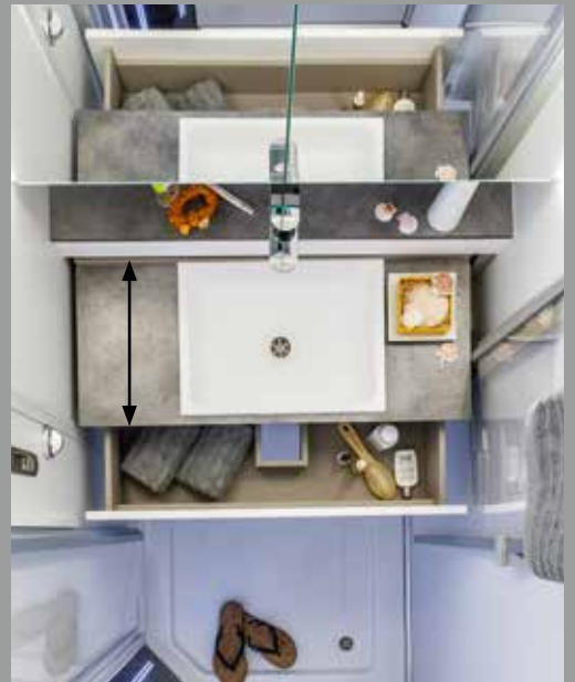
Simply push to open the vanity