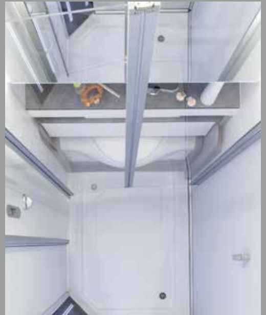
Spa-like shower with extra-large tray