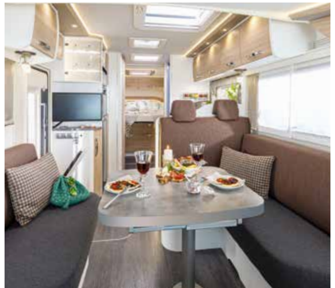
↑ Every FRANKIA PLATIN is unbelievably spacious.