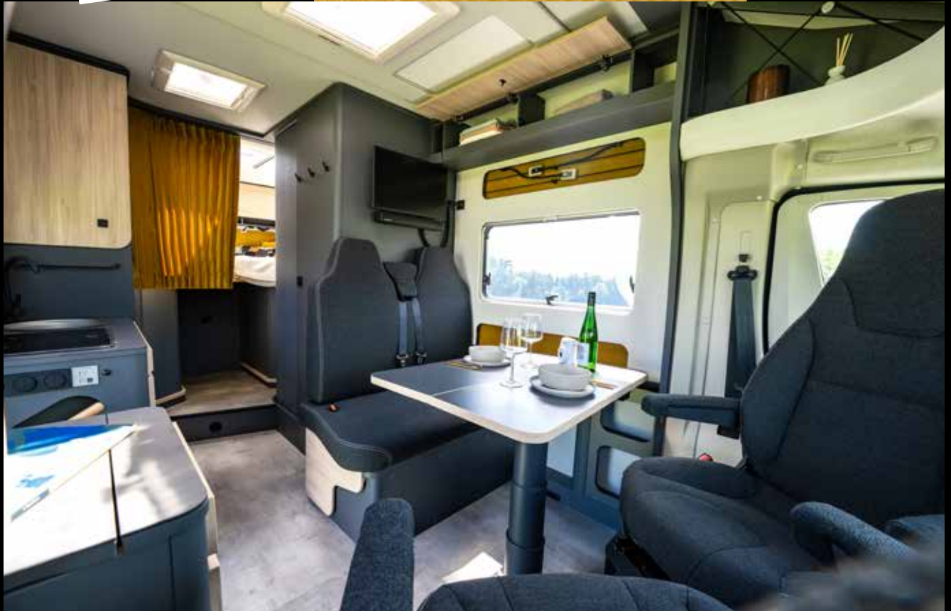
↑ Clear sight lines, indirect lighting and fresh colour schemes – NOW is shaping the future of motorhome travel.