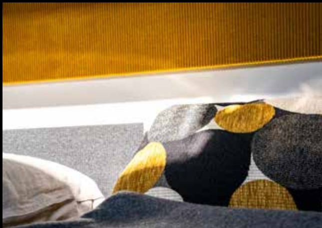
↑ ... Inside, a clean style with fresh accents takes centre stage.