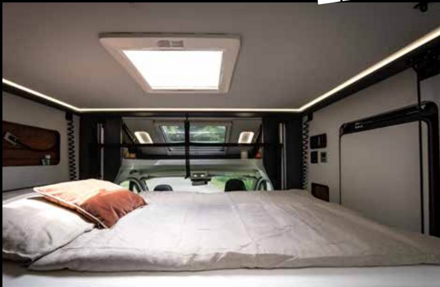
↑ The optional power drop-down bed above the seating area is also flooded with natural light.