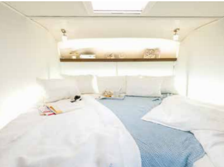
↑ Sleep, read and stream in style in the front drop-down bed.