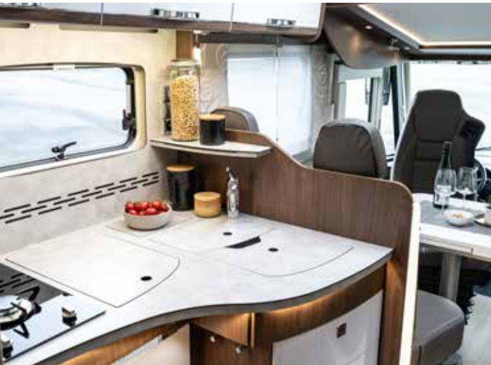
↑ Storage space for everything you need to enjoy cooking in the FRANKIA MaxiFlex kitchen.