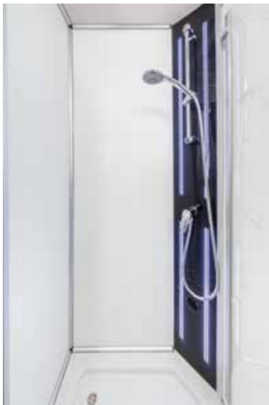
↑ Refreshing shower