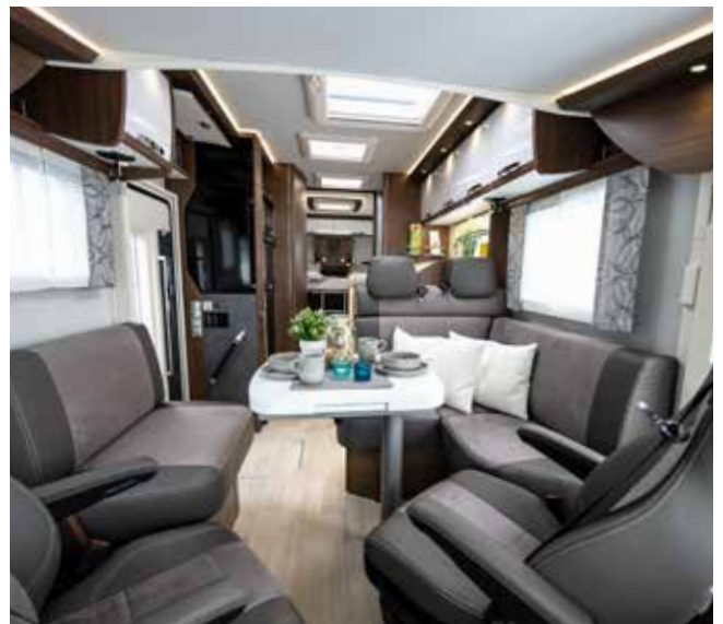
↑ Interior highlight: the exclusive microfiber leather upholstery