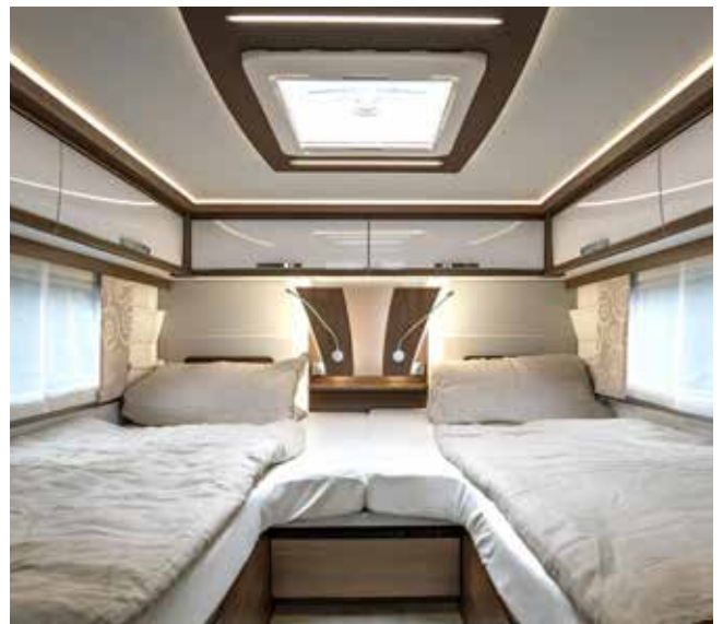
↑ Relax like never before in the bedroom with separate beds