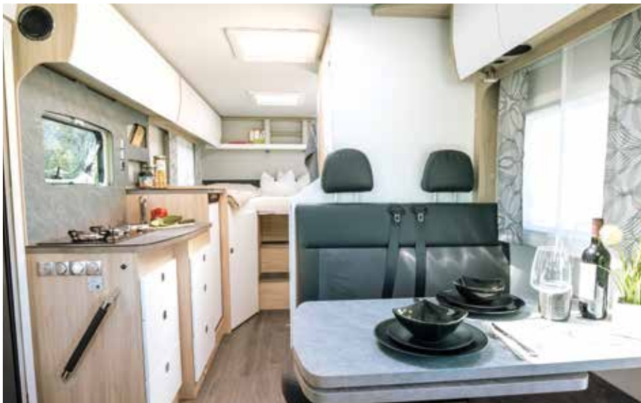
↑ This is how freedom feels: 2 m of headroom throughout in all A-Class FRANKIA NEO models

NEW: FRANKIA MI 7 NEO in the BLACK LINE Edition featuring its own design and even more equipment on top