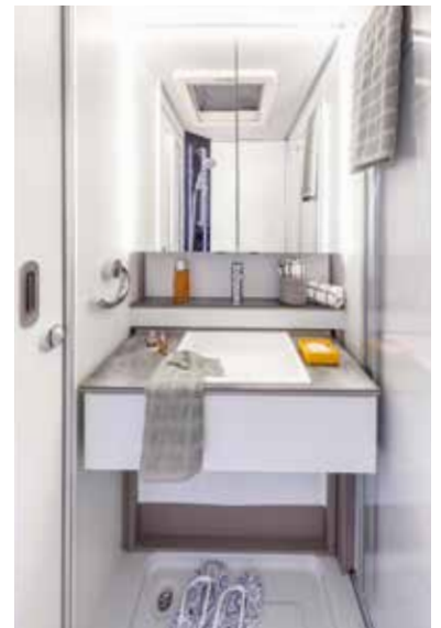
↑ Refreshing: smart bathroom