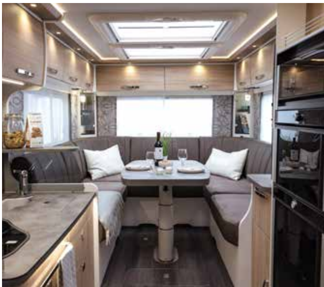
↑ A classic now also in the PURE edition: PLATIN with round seating group!

Distinctive exterior design – incredible spaciousness