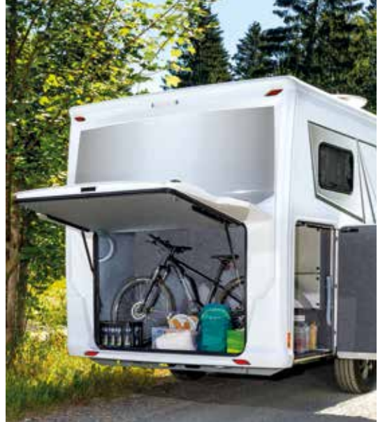
↑ Clever packing and unpacking: the FRANKIA Easy-Load system

Upgrade: FRANKIA MT 7 NEO in the BLACK LINE Edition featuring its own design and even more equipment on top