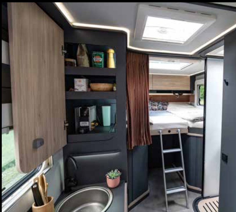
↑ The three-sided NOW Tower enables you to access storage space from the kitchen and the bed.