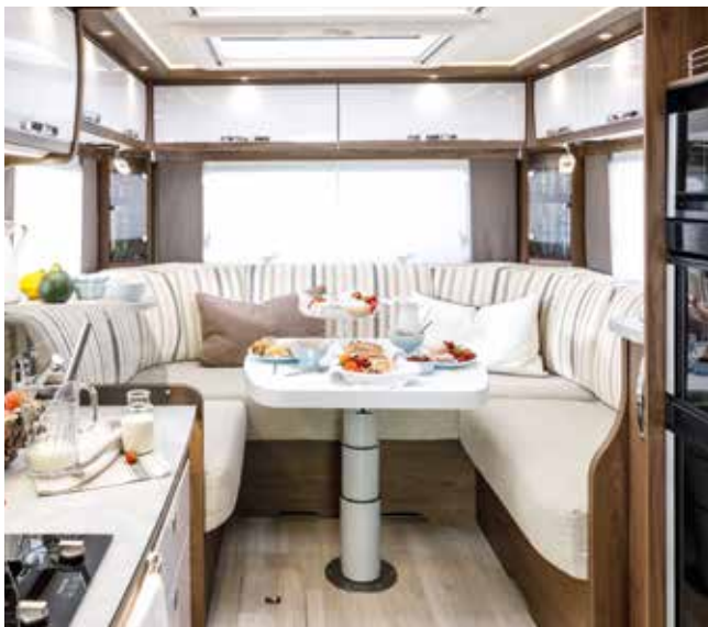
↑ This is the life: total bliss in the large seating area.