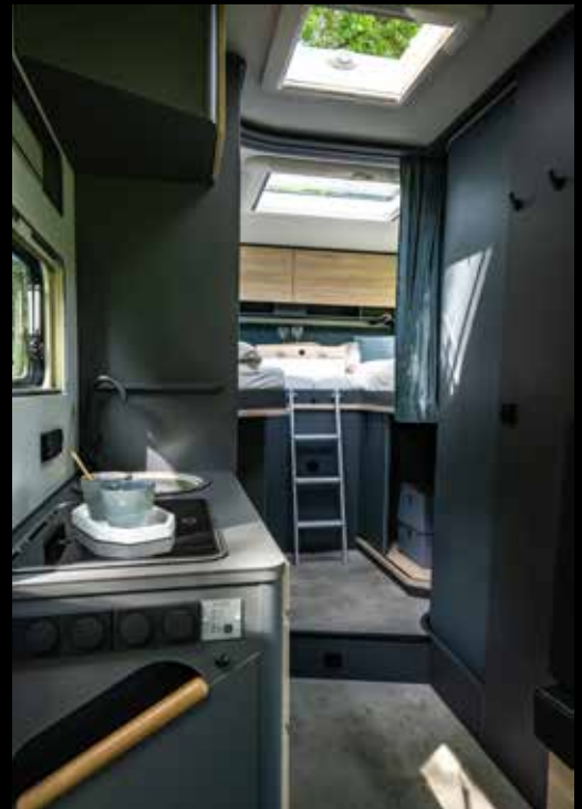
↑ Enjoy a feeling of lightness and well-being in the expansive open areas