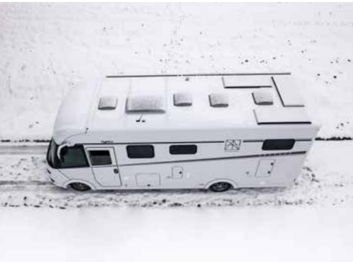
↑ Exclusive technology allows you to travel independently – even in the winter