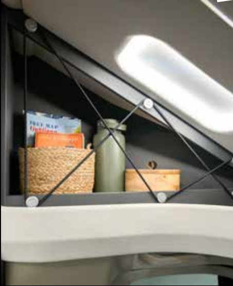
↑ WOW, NOW: Every inch is cleverly utilised!