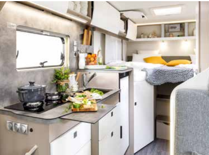
↑ Kitchen highlight: Refrigerator with a volume of up to 138 l