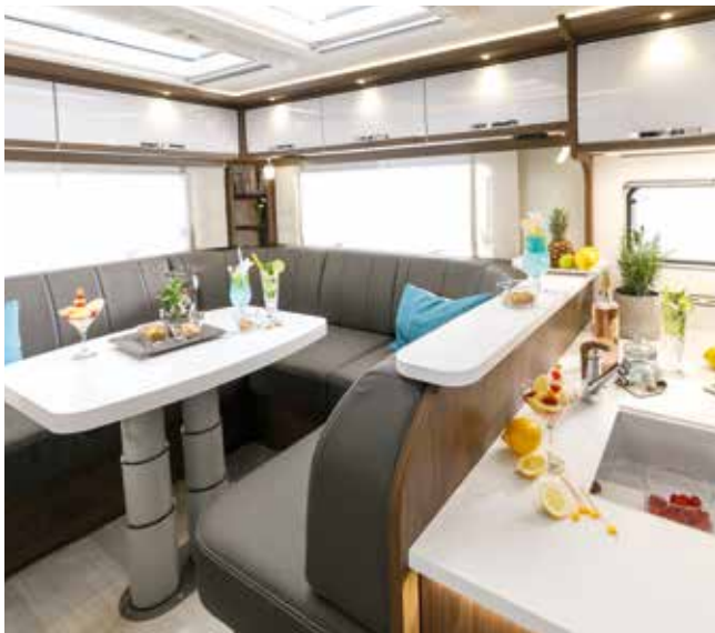
↑ Very FRANKIA: Relax in the extra-large round seating group!