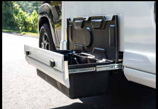
↑ Perfect for leisure equipment: the pull-out exterior storage compartment.