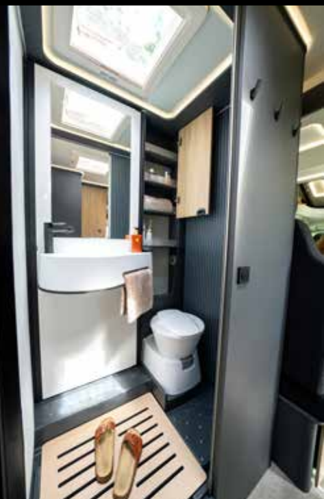
↑ The perfect place to freshen up: the variable bathroom