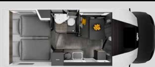
↑ FRANKIA NOW 7.0 L 3.5 T*

* Please refer to page 02 for important information regarding the Technical Data.