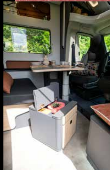
↑ Another smart detail: the multifunctional box