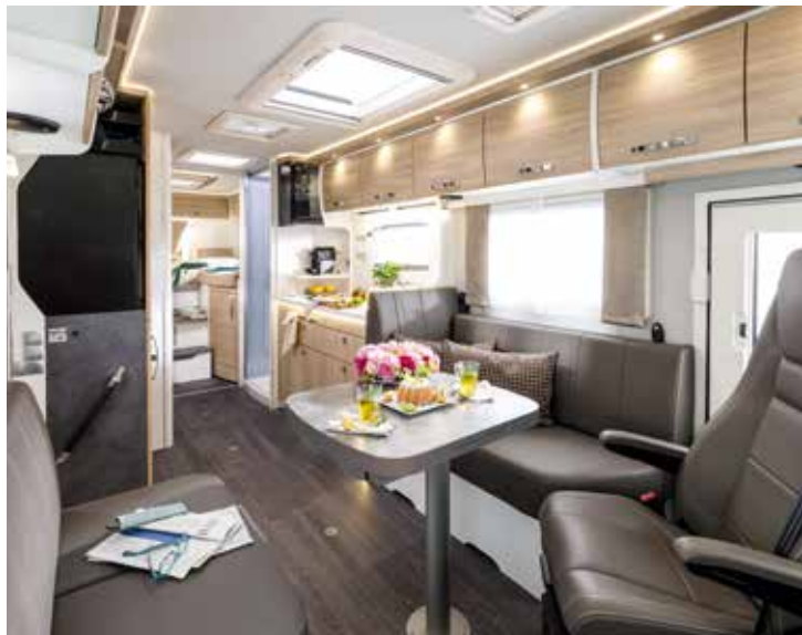
↑ This is ultimate freedom: the new FRANKIA TITAN GDW