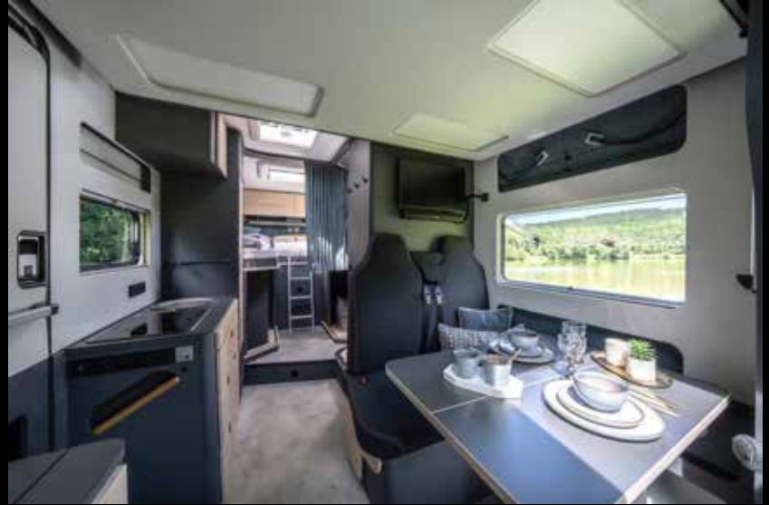
↑ NOW features a subtle style that embraces clarity and offers creative freedom.