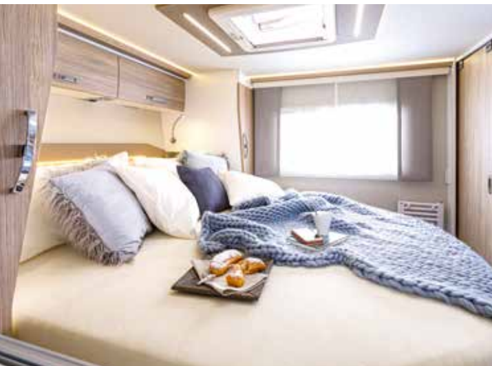
↑ There's so much more! 1.60 m XL queen-size bed