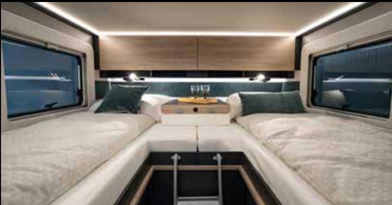
↑ A five-star sleeping experience: lighting, ambience, space, freedom, details