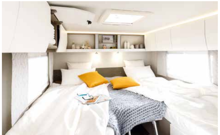
↑ Very spacious for a lightweight model: separate beds in the rear.